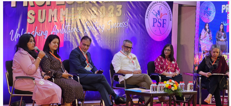
Panel discussion "Bridging Career Gaps – Embracing & Enhancing Women's Career Journey."