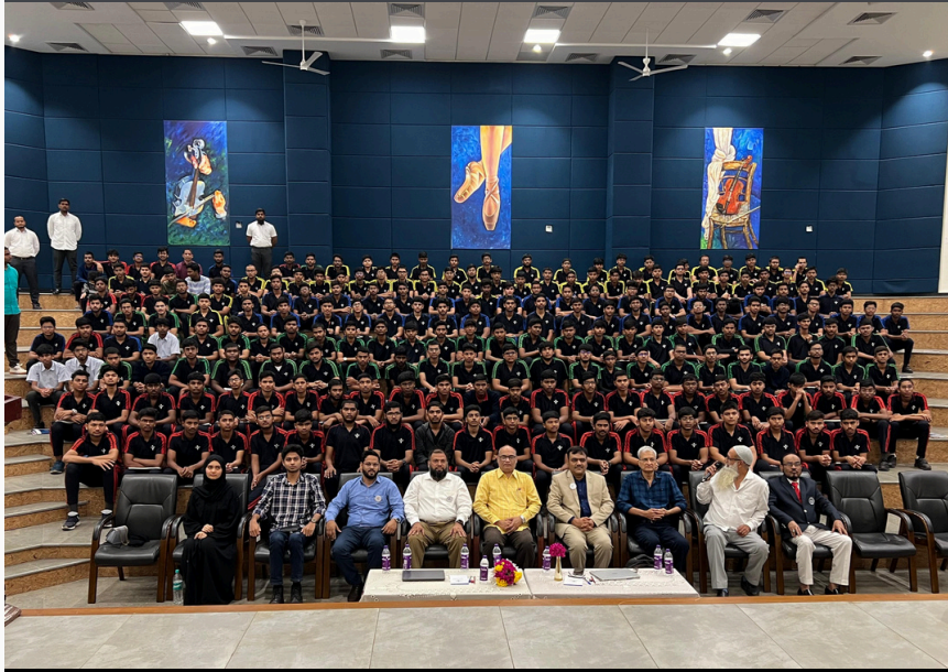
HYDERABAD INSTITUTE OF EXCELLENCE