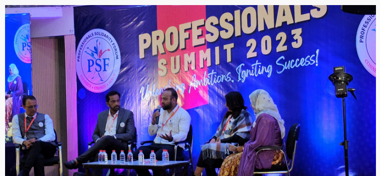
Panel Discussion on "Creating Socially Responsible Professionals"