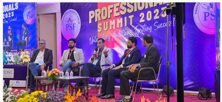
Panel discussion on "GenAI: A Boon or a Bane?"