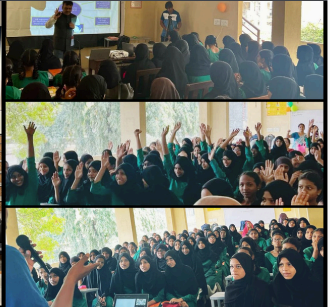
GOVT. GIRLS SCHOOL

January 2024 saw two Career Guidance Programs conducted by PSF at Hyderabad Institute of Excellence in Vikharabad and Government Girls School, Shalibanda.